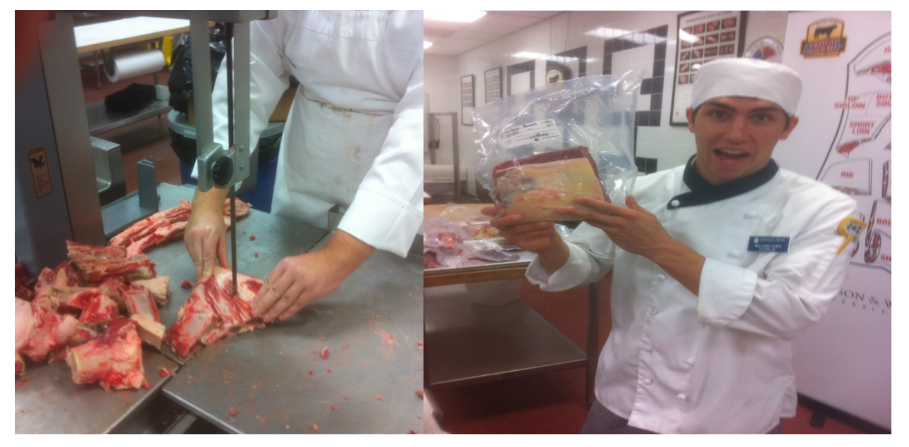
Cutting bones using proper technique