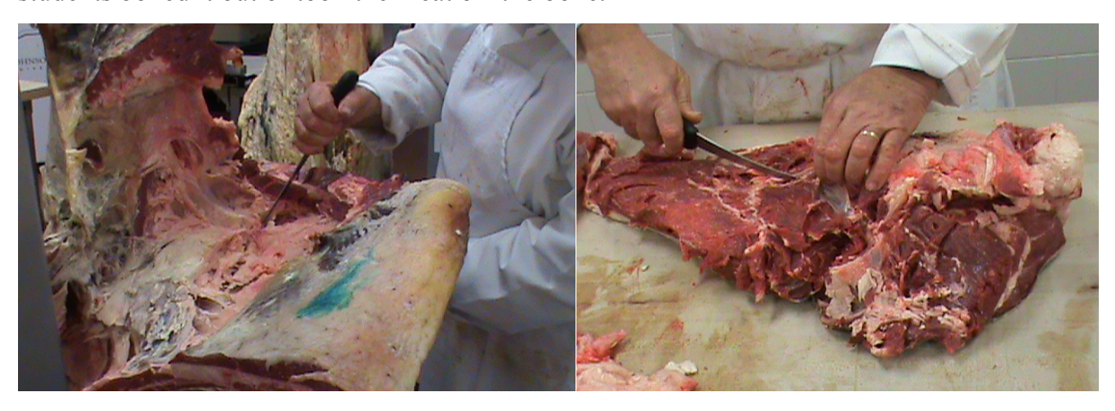
Separating the Brisket of beef from the chuck

The side of beef has 13 rib bones. There are five on the chuck, seven on the rib and the lucky 13<sup>th</sup> on the loin. It is an industry standard method. We separate the chuck and rib by counting down the five rib bones and separating it with a knife cut then sawing it. The chuck swings a little, which is why they use to call it swinging beef. It is made up of the neck and shoulder meat which is separated by a blade bone. The shoulder contains the Petite Tender (Lazar Steak), the Flat Iron and the Ranch cut besides other muscles that we will use for stew or chopped meat. We also take off the Brisket (Pot Roast, Corned Beef or Texas Style Barbq) and one of the students boned it out or took the meat off the bone.