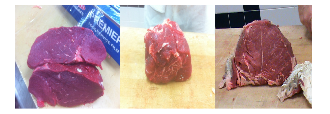
This is the Top Round trimmed and split. The middle picture is from the hind shank, look how cherry red it is.