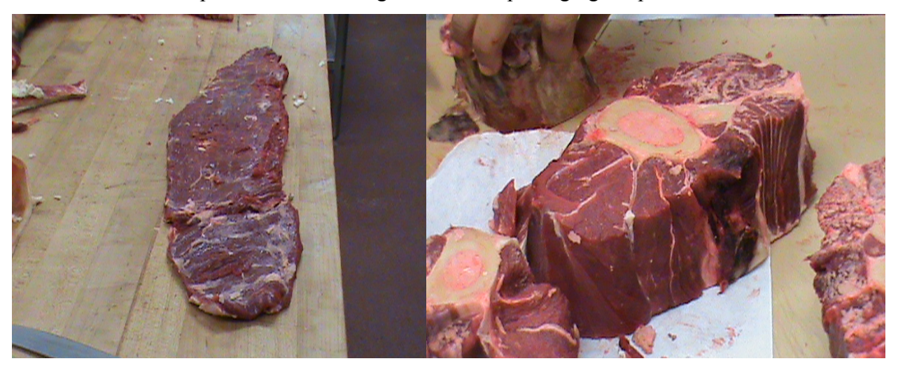
Trimmed Flap meat

Here are a few more pictures from cutting the bones to packaging the product: