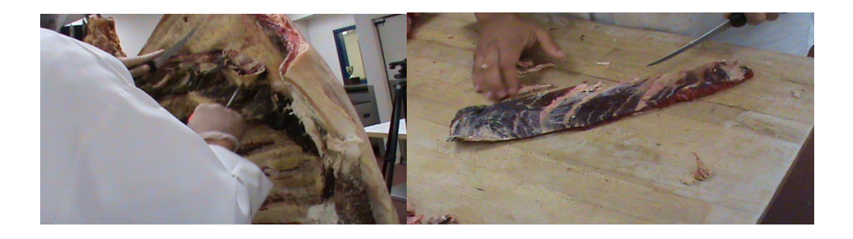
Figure 1 Taking the skirt steak off